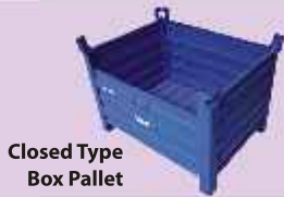
Closed Type Box Pallet