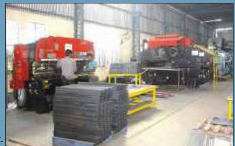
Sheet Metal Deptt.