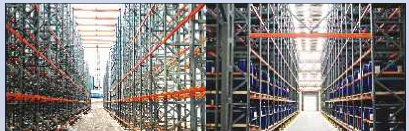
RSW (Under Installation)