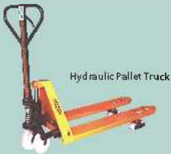
Hydraulic Pallet Truck