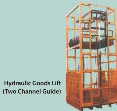
Hydraulic Goods Lift (Two Channel Guide)