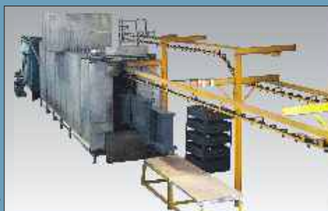
Powder Coating Line