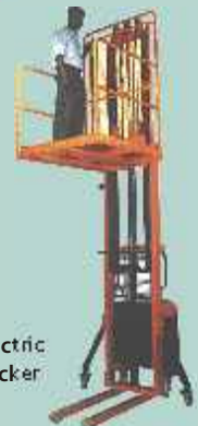
Semi Electric Order Picker