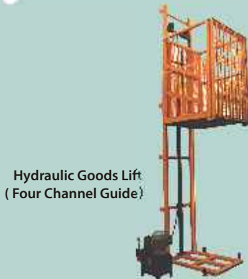
Hydraulic Goods Lift ( Four Channel Guide)