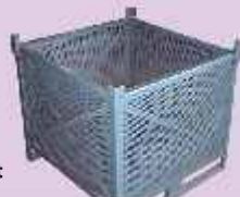
Perforated Metal Pallet