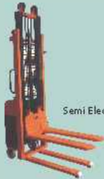
Semi Electric Stacker